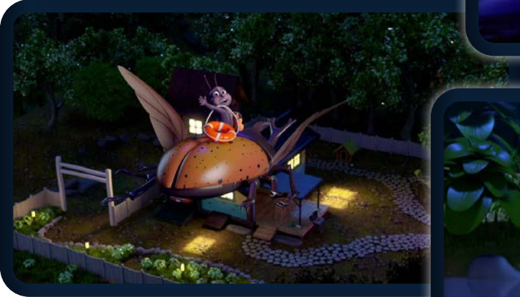
HIGH ABOVE THE HOUSE