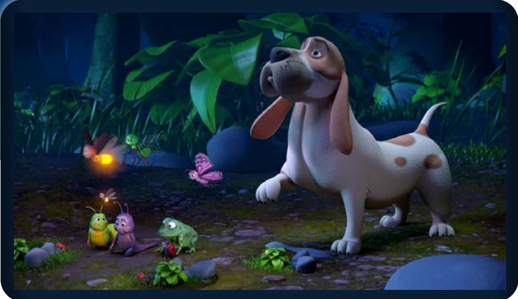
THE GANG WATCHES SEBASTIAN FLY

For more scenes in higher resolution watersideproductiongroup.com/media